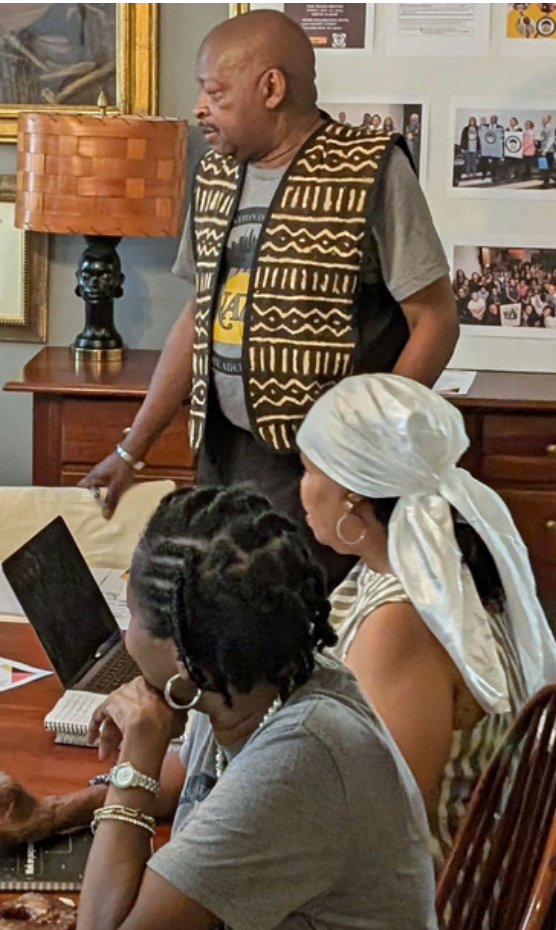
NABJ Board meets to map out programming and next steps.

On Friday night May 2, a “Returning to Our Roots” gathering will honor those who came before us, along with a “Looking back to look forward” speech by a nationally named media star, and a photo exhibit of the history of Black journalists in Philadelphia and the community captured by local Black photographers. Our guests will enjoy cocktails, hors d’oeuvres and a live auction of the photographs.