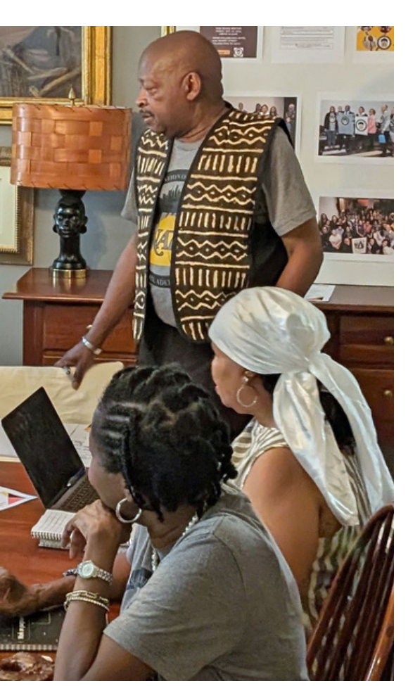
NABJ Board meets to map out programming and next steps.

On Friday night May 2, a "Returning to Our Roots" gathering will honor those who came before us, along with a "Looking back to look forward" speech by a nationally named media star, and a photo exhibit of the history of Black journalists in Philadelphia and the community captured by local Black photographers. Our guests will enjoy cocktails, hors d'oeuvres and a live auction of the photographs.